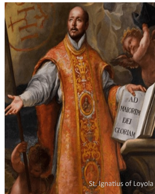
St. Ignatius of Loyola

Until 1969, the various Catholic liturgies were all of apostolic origin. The Gregorian Latin liturgy, celebrated in this church, follows the tradition of Saint Peter, the first Pope, and has never undergone any essential change till the present time. Every gesture, every word has been weighed and measured with the assistance of the Holy Ghost for the greatest glory of God and the salvation of souls.